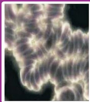
Thick coil like cells

The instant benefits of structured Solé Water™